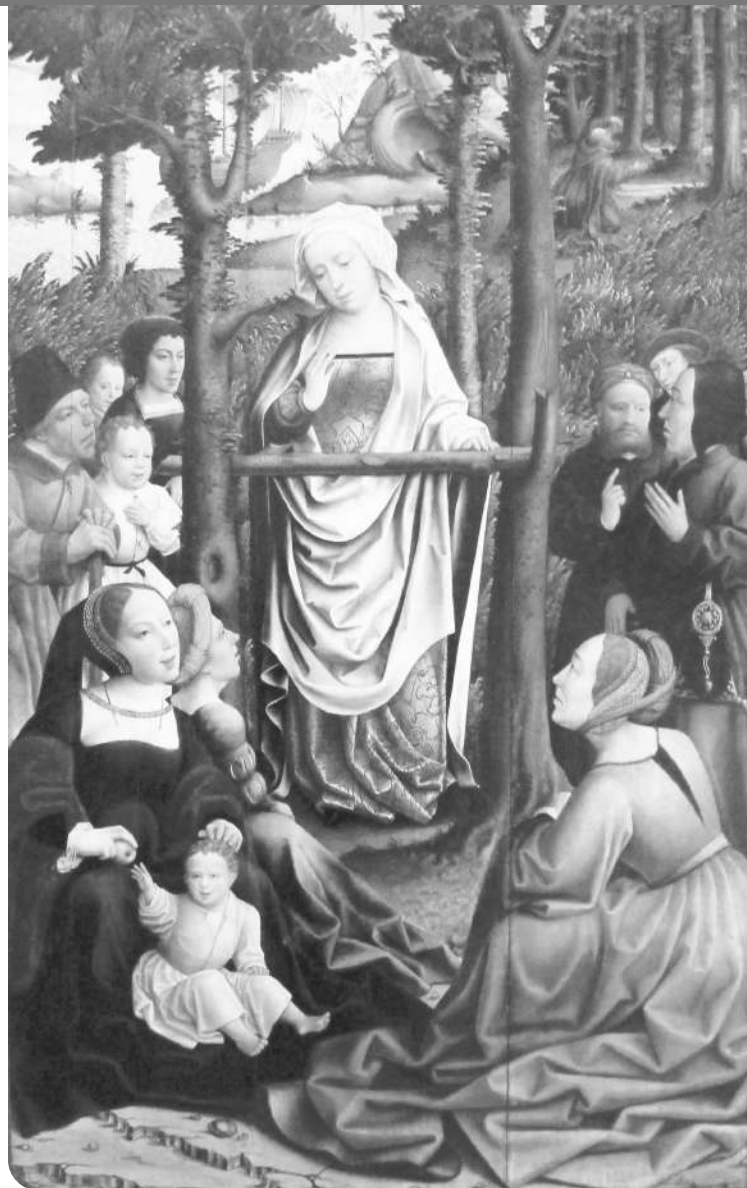
Saint Mary Magdalene Preaching

What is your witness? Write out some notes about your story as you would share it with friends and family.