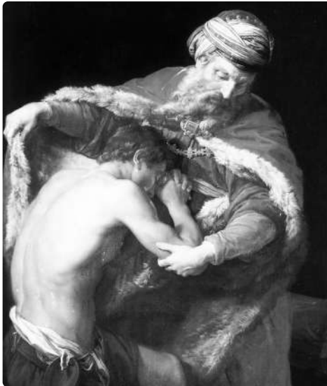
The Return of the Prodigal Son by Pompeo Batoni

W e encounter one of the most cherished parables of Our Lord in this Sunday's Gospel. It is usually called "The Prodigal Son," but I prefer to think of it as "The Story of a Generous Father"... it truly captures the essence of God's love.